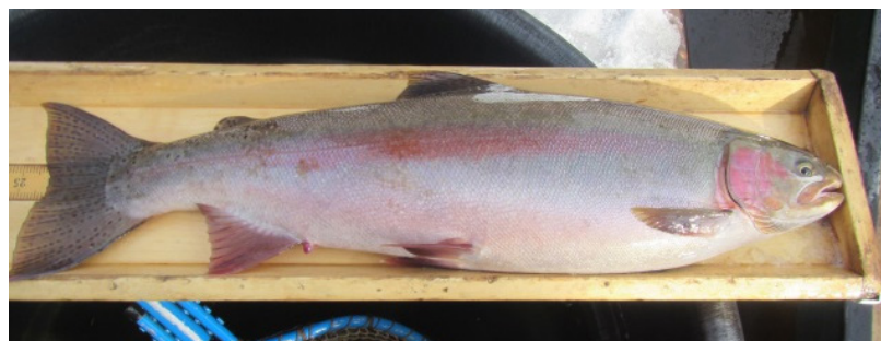
A 25-inch steelhead from the Bois Brule River during a December 2015 Wisconsin DNR survey.