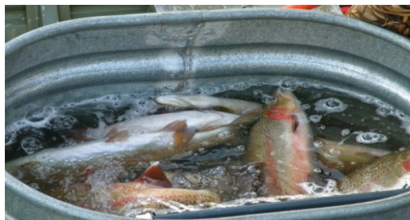
Steelhead captured from the Bois Brule River during a December 2015 Wisconsin DNR survey.