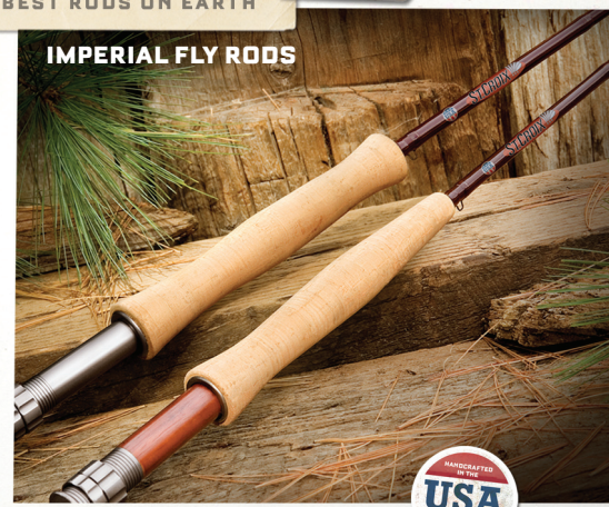
IMPERIAL FLY RODS