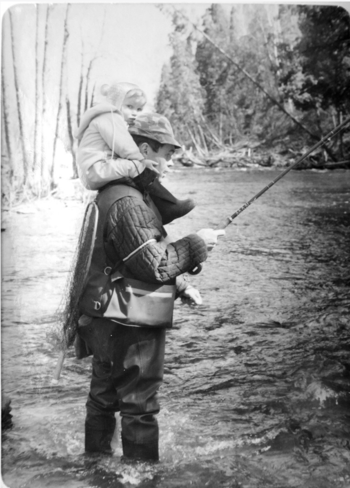
Post Card From The Past.